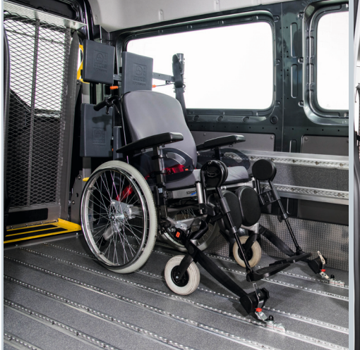
The wheelchair enters the vehicle via lift. AMF-Bruns PROTEKTOR system for wheelchair and occupant restraint.